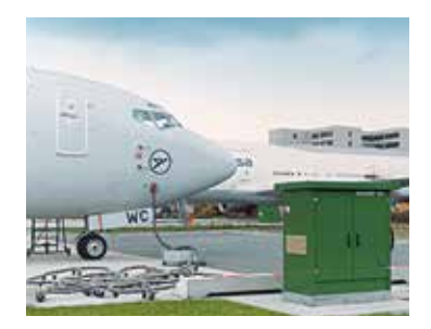
Piller Gate Box.