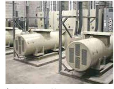
Central system with Piller Motor-Generator Sets.