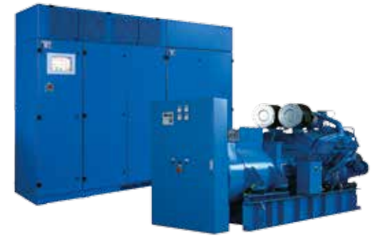
UNIBLOCK<sup>™</sup> Diesel Rotary UPS System.

Every organisation hopes they never have to call upon their UPS systems but with Piller there comes the ultimate peace of mind.